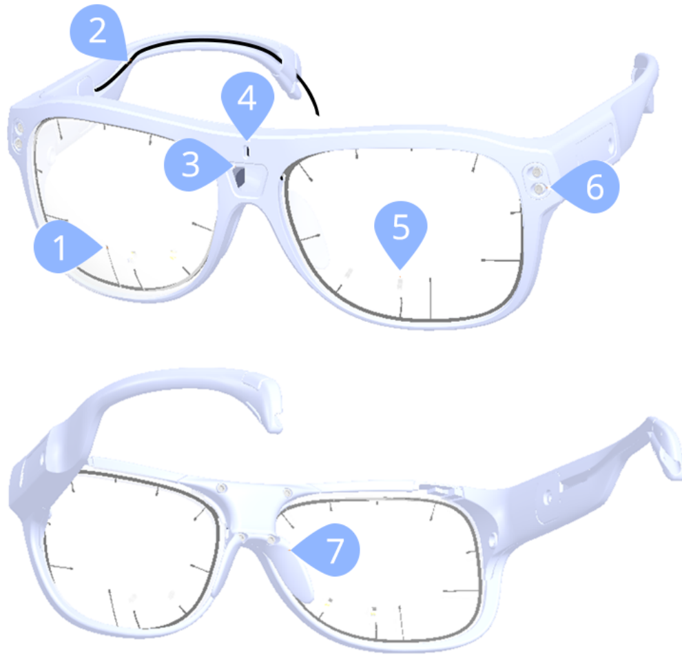
Figure 1. The head unit or "glasses"

The head unit consists of the following parts: