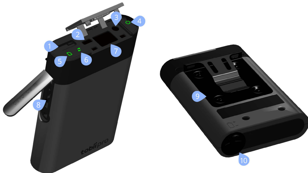
Figure 2. The recording unit

The recording unit consists of the following parts: